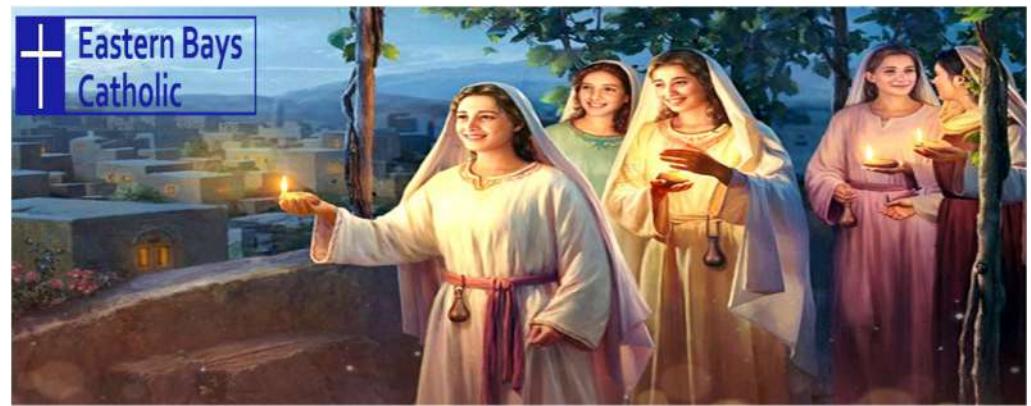
Gospel Matthew 25.1-13