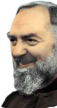
- Saint Padre Pio

"Pray, hope, and don't worry. Worry is useless. God is merciful and will hear your prayer."